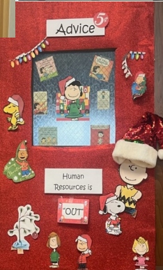
Thank you to Everyone who participated in making Citizens Holiday a Happy One.