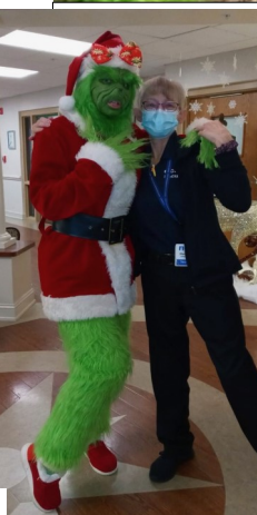
Instead of disturbing Santa this year we asked this fellow in green to pay our Residents a visit!