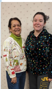
More Decorated Doors.