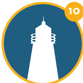
EDNA BUTUK LPN May 21, 2010