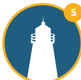
REGINA SAGANDYOY Dietary Aide April 30, 2015